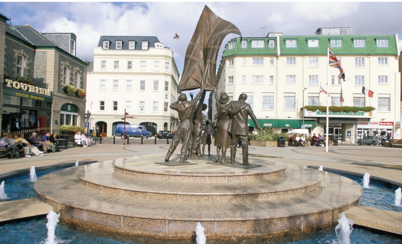
Liberation Square, Jersey